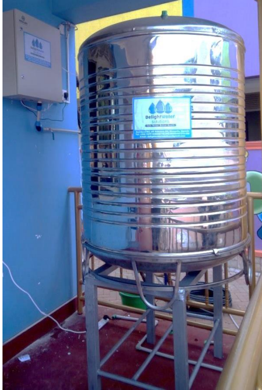
UV system in a Premium Cage installed with 1000l smart tank at Kampala Preparatory school, Kitebi