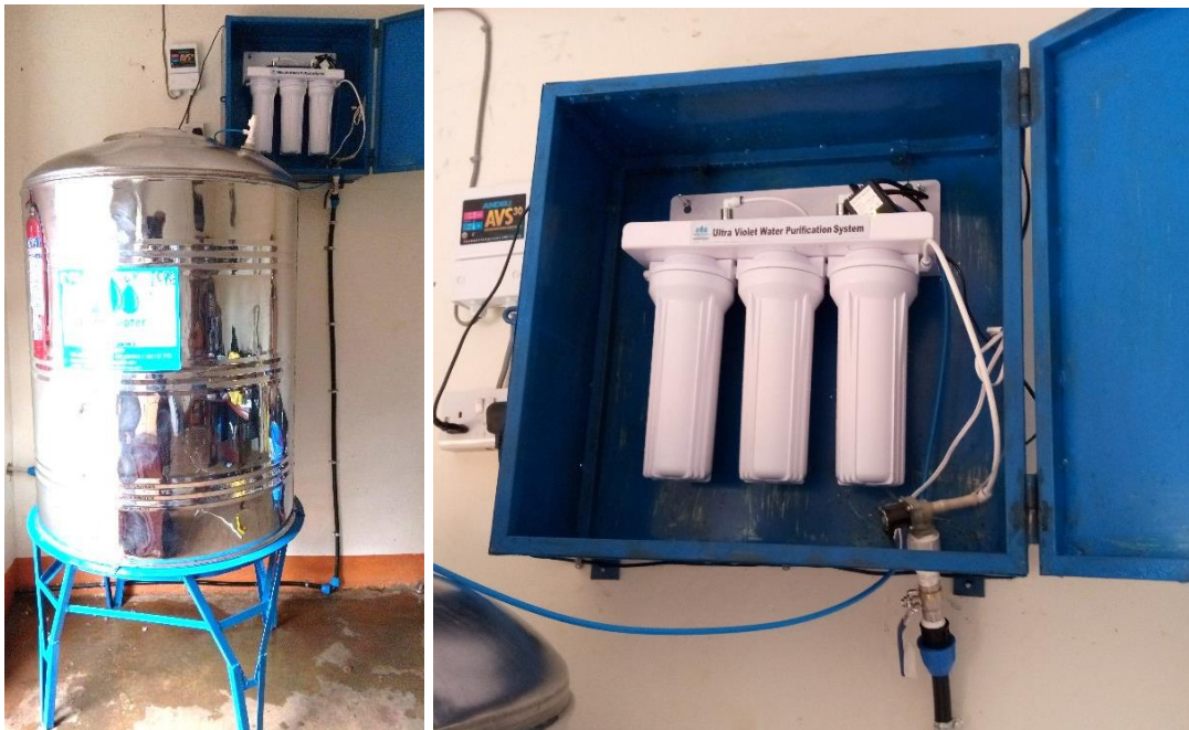
UV System in a standard Cage and installed with 1000l smart tank at Walukuba CDC