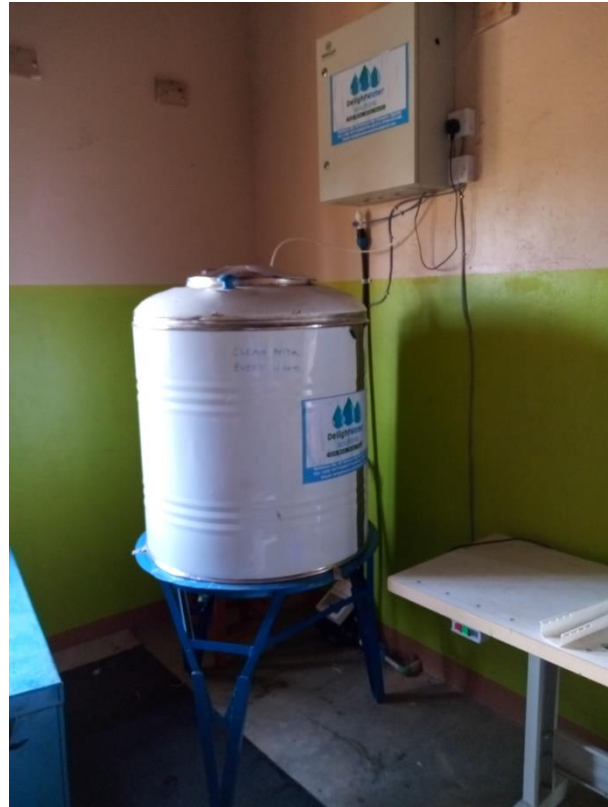
UV systems in a Standard cage (left) and Premium Cage(right) installed with 1000l and 450l smart tanks at Genrwot CDC Bweyale and Busolwe CDC Butaleja, respectively funded by Compassion International.