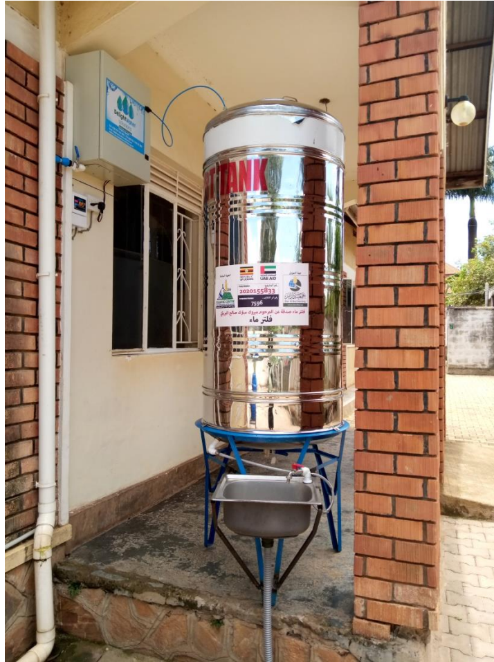
UV system in a Premium Cage installed with 750l smart tank at Shifah Medical Centre, Kampala, financed by Islamic Centre for Education and Research.