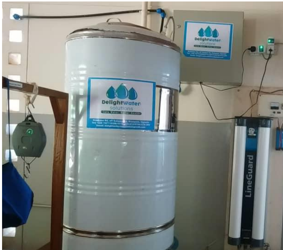
UV system in a Premium Cage installed with 750l smart tank at Gombe Hospital, Butambala financed by Islamic Centre for Education and Research.

We have installed over 35 institutions for this organization and some of them are Lugazi Health Centre, Kinawa HS Kawempe, Mariam High Kisaasi, Gombe Hospital, Kibuli Muslim Hospital, Kibuli Core PTC, Kibuli Demonstration School, Kibuli Core PTC, Kibibi SS, Bukomansimbi SS, Shifah Medical Centre etc